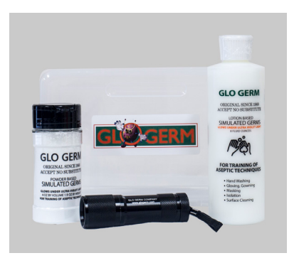
Kit pictured with Gel