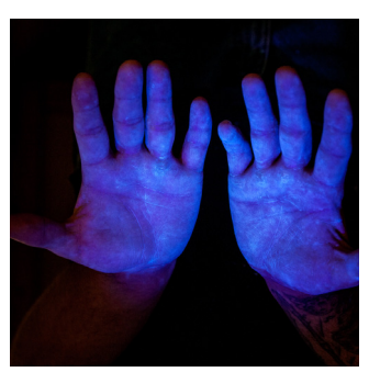
2. Hold hands under UV lamp to show "glowing germs".