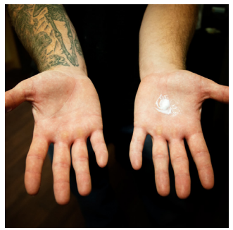
1. Apply Glo Germ Oil or Gel to hands per instructions.

TIP: Complete removal of Glo Germ with normal washing is more difficult if skin is chapped or cracked, indicating that bacteria is also harder to remove. This will require a hand care regimen with a quality lotion twice daily and a judicious use of a hand sanitizing gel.