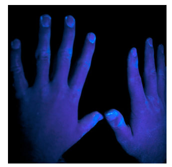
4. Check hands under UV lamp to show areas not washed properly. Pay close attention to knuckles and cuticles.