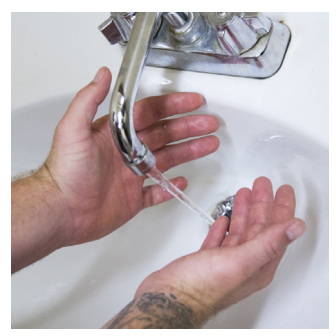
3. Wash hands with soap and water as usual.