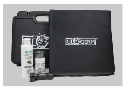
Kit pictured with Gel