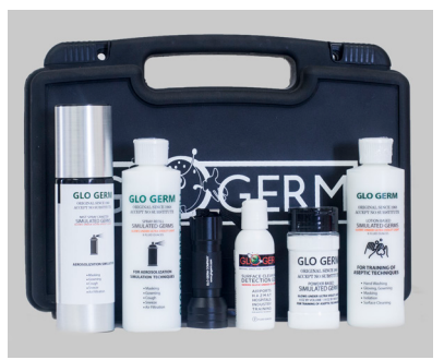
Kit pictured with Gel