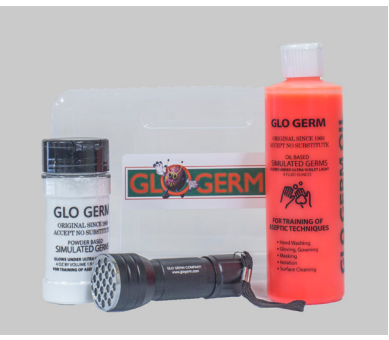
Kit pictured with Oil

This Kit contains a hand-held 21 LED UV Flashlight, an 8 ounce bottle of Glo Germ Gel/Oil, 4 ounce bottle of Glo Germ Powder, three AAA batteries in a case. K1G2(Gel)......$92.50 K1O2(Oil).....$92.50